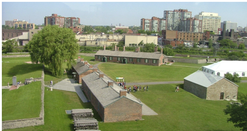
The Thomson family was involved in the 1815 construction of the four brick and stone buildings at the west end of the fort, seen here from the south. The South and North Soldiers' Barracks are to the left, the Officers' Brick Barracks and Mess Establishment in the centre, and the Stone Magazine to the right.