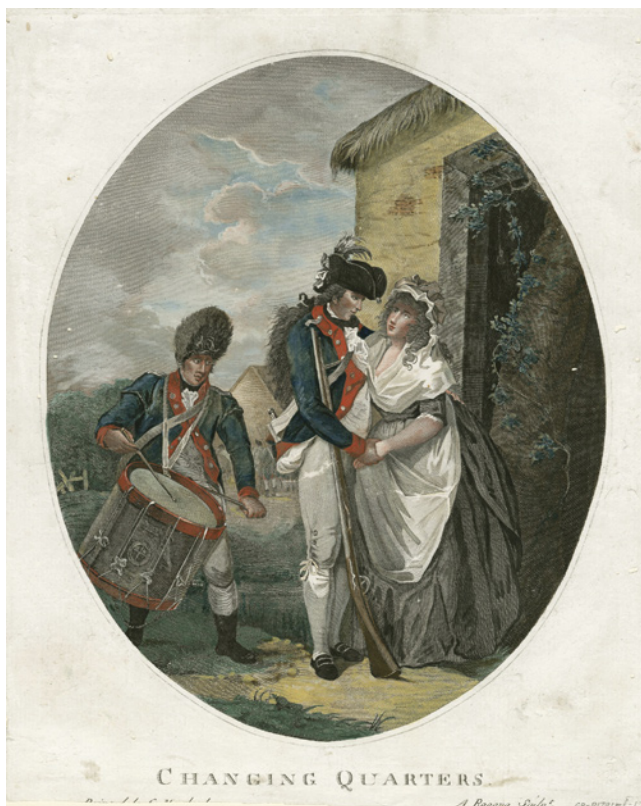
George Morland's depiction of lovers parting captures the sacrifice made by British soldiers posted abroad. Only six wives in a hundred, selected by lottery, were allowed to accompany their husbands; the rest stayed home. Couples lived together in the barracks, where the women took care of washing, cooking, and sewing. Hence, most soldiers functioned as single men.