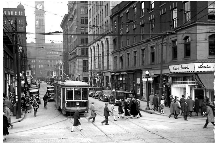
In prim black and white livery with lace-curtained windows filled with trays of chocolates, Laura Secord shops were designed to stand out from their more sombre neighbours. The one at Bay and Adelaide streets in Toronto, seen here in 1927, operated until the mid-1950s. Beyond, at the head of Bay Street, is the clock tower on City Hall and a turret on the Foresters’ Temple Building.