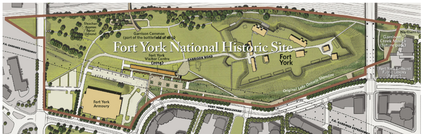
Landscape Master Plan for Fort York National Historic Site. Prepared by DTAH, Toronto, 2012.

Working with the Toronto Parking Authority, we have recently implemented a 'Pay and Display' parking system at Fort York. Given our location in downtown Toronto, with many other major tourist destinations in the vicinity and 6000 new units of housing to the immediate south, the need to implement such a system was pressing. The objective is to keep the small amount of parking that we have priced reasonably, but available at all hours. The majority of net revenues from the parking operation will be directed back towards programming at Fort York.