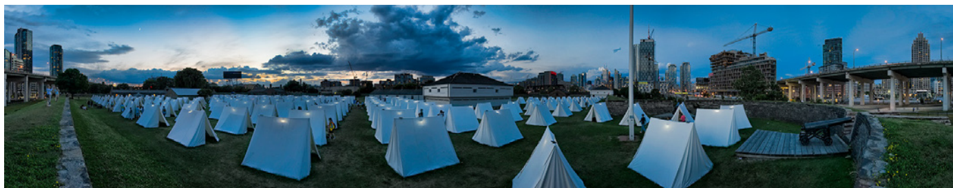
Panorama of The Encampment installation at Fort York during Luminato 2012.