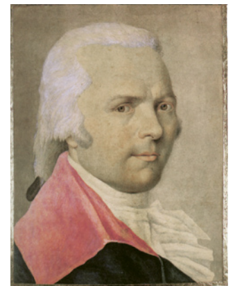
William Berczy, self-portrait in watercolour, c. 1798–99.

Mar. 23 The ‘Patriotic young Ladies of York’ presented colours they had embroidered to the 3rd Regiment of York Militia. Now restored, these will be on display in the Visitor Centre at Fort York.