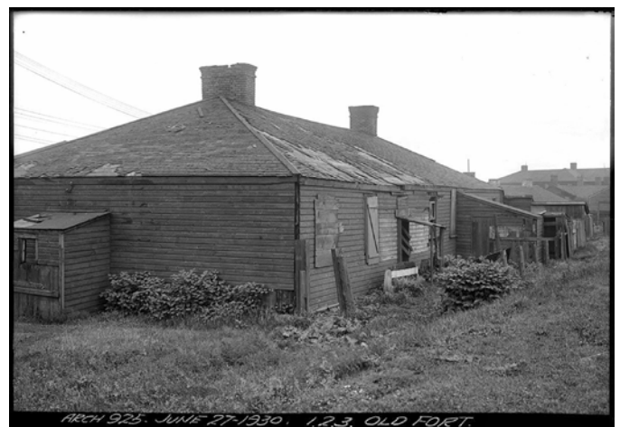
In 1914 the buildings inside the fort received numbered street addresses. The 1838 Artillery barracks became 1, 2, and 3 Old Fort Road as indicated on the photograph dated 27 June 1930.