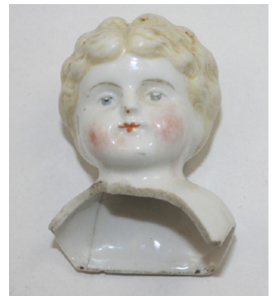
Porcelain doll head.

Also remarkable are seventeen artifacts (marbles, a doll's head) relating to children. Eight of them were recovered in contexts that suggest they were deposited between 1868 and the mid-1930s rather than having been brought into the site later, for example within the fill that was used for leveling the parking lot.