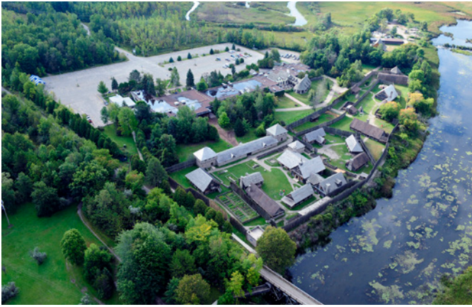
Sainte-Marie-Among-the-Hurons, near Midland, ON, is on an inlet off the Wye Marsh in Georgian Bay, Lake Huron. The reconstructed mission is screened from the parking lot and a railway by the Visitor Centre, a high palisade, and thick plantings.

magical today is the orientation film: as the closing scenes appear, the screen rises and viewers are invited to walk directly out into History.