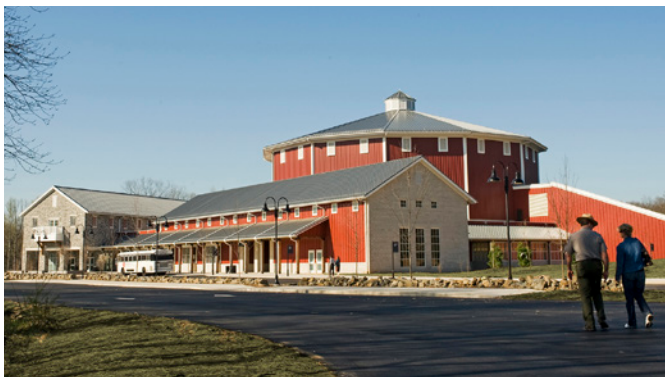
The Gettysburg Museum and Visitor Centre, at 139,000 square feet in size, is larger than the Fort York Armoury but broken into smaller volumes so it's not overwhelming. The tall polygonal structure that resembles a round barn houses its cyclorama.