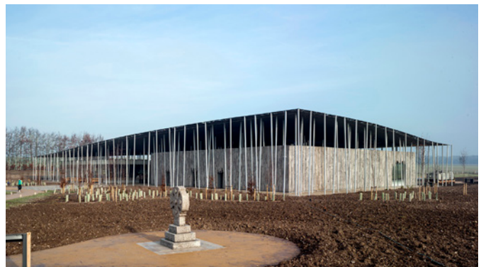
The new Stonehenge Visitor Centre near Salisbury, England, is seen here just before its opening day in December 2013.