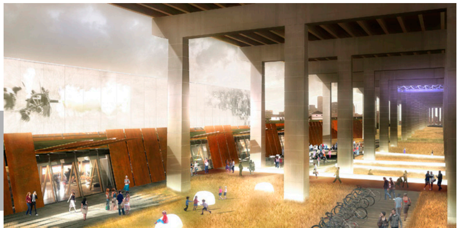
In the design competition for the Visitor Centre, Patkau/Kearns Mancini included as part of their entry this eerily prophetic perspective view of the building's forecourt under the Gardiner. Note the Watertable artwork was included in the sketch. (Credit: Patkau/Kearns Mancini, architects. Rendering by Patkau/Luxigon)