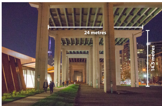
The elevated Gardiner Expressway is at its highest point in front of the fort's Visitor Centre. The ground on the right will be part of the 'Liquid Landscape' of walks and grasses to be installed when overhead work on the deck of the Gardiner is completed in July, 2016.