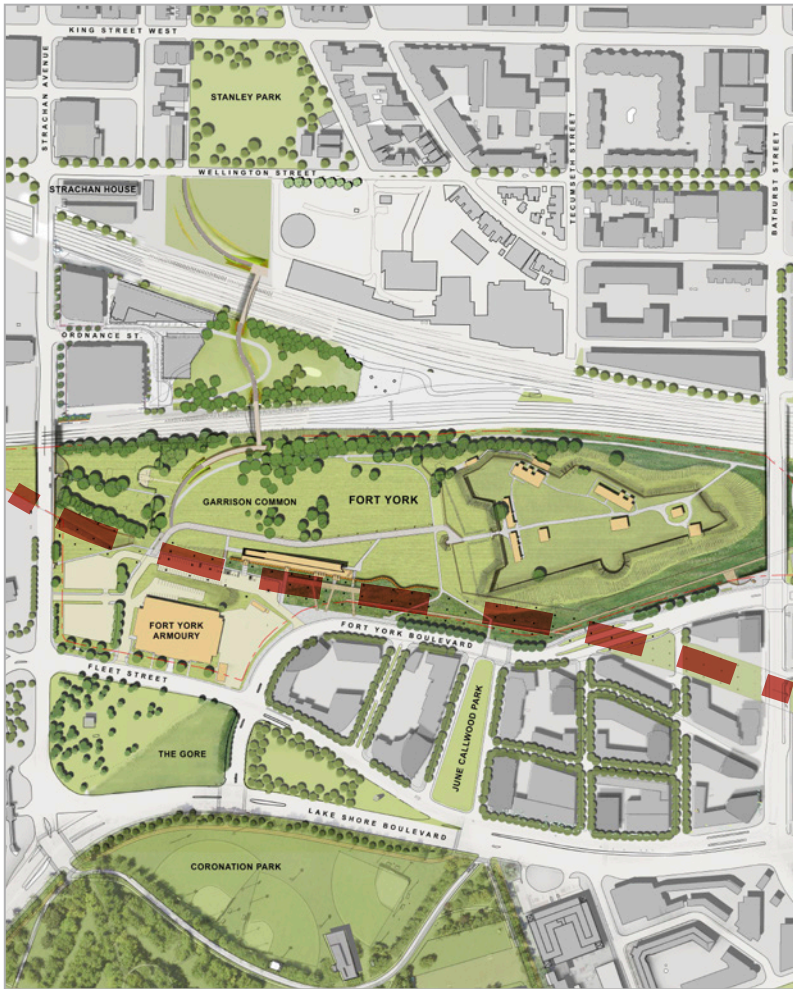
Top left: Much consideration was given to how the south bridge landed on the Garrison Common. The viewing platform, stair and westward-leading ramp seen here are meant to soften its impact compared with a scissoring ramp that was proposed originally.

An overview plan of the parks and open spaces in the west downtown shows clearly that the Fort York Bridge is the missing link to realizing a large network of useful bike paths and off-road walking paths. This would have been so even before the Under Gardiner initiative was announced. But now we have two significant pieces of infrastructure designed to meet at Fort York, and to be completed in less than two years. We're reminded of the question posed by a Toronto newspaper contemplating an earlier building boom in the mid-1840s: "Who shall say what Toronto may not yet be?"