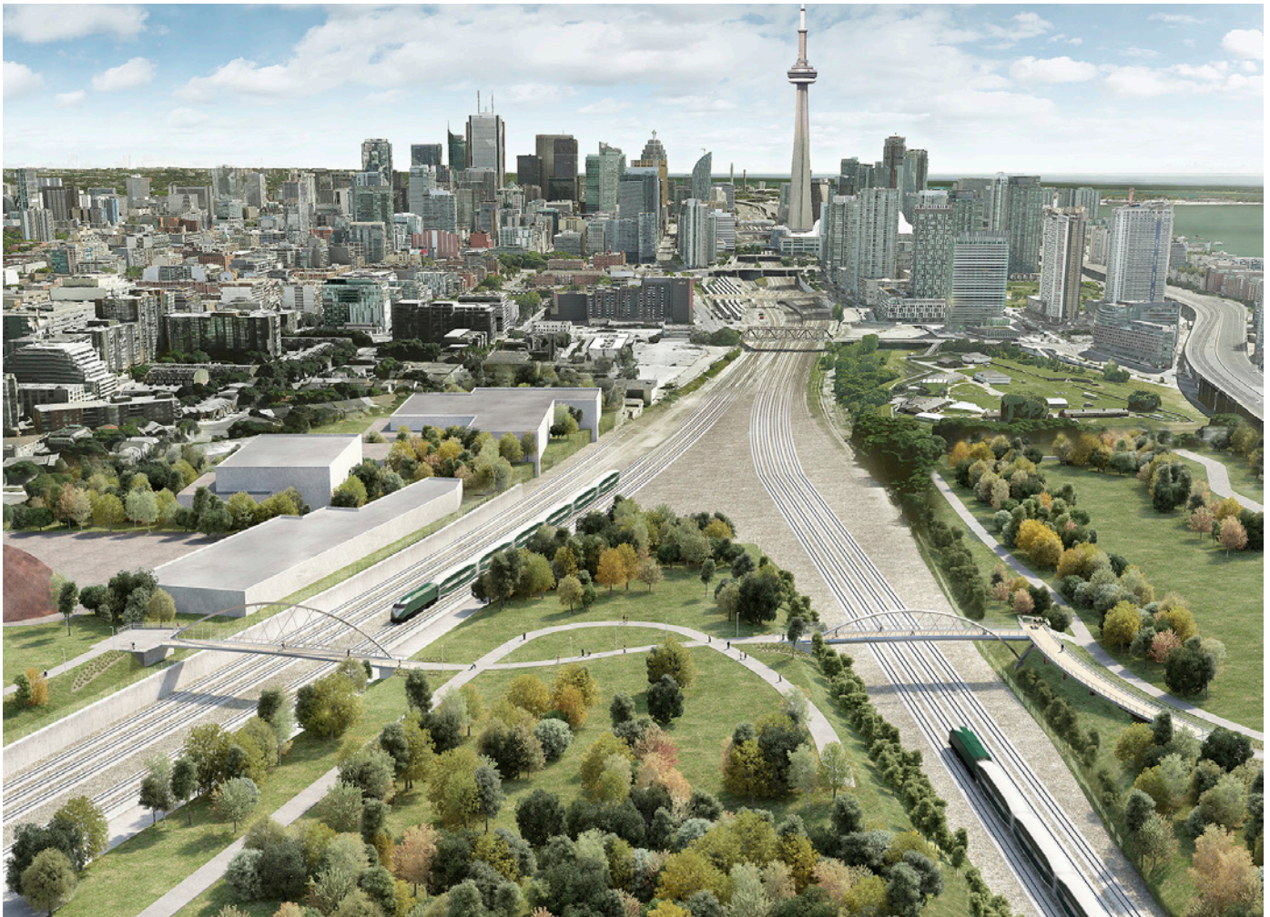
This birdseye view shows how the paired bridges work together to connect the south extension of Stanley Park (left) with the Garrison Common at Fort York (right). Also how they give access to parklands at the east tip of the so-called Ordnance Triangle (foreground).

Dufferin's team brings much experience to the project. The company itself has been in the business of building things since 1912. Among them have been dozens of Ontario highways, the Highway 407 ETR, and the Air Rail Link spur from the Georgetown rail corridor into Pearson Airport. Pedelta are the civil engineers on the team. Headquartered in Barcelona but with a Toronto office, they have designed for Fort York one of the first sets of stainless steel bridges in North America. DTAH bring to the bridge their architectural expertise and more than twenty years experience with the landscape of the Fort York National Historic Site. Lighting experts Mulvey & Banani and geotechnical consultants Golder Associates, who'll be advising on the bridges'