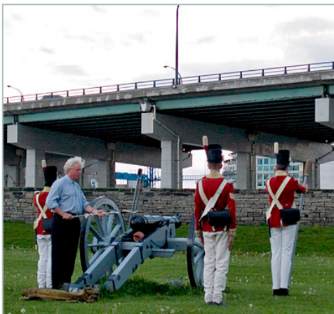
At a reception at the fort in 2006 Mayor David Miller was persuaded to fire a cannon at the Gardiner, which withstood the assault handily.

To say the project has been worthwhile is an understatement. The Visitor Centre at Fort York is a $22 million bet that has paid off handsomely in mirroring the city to itself. It is symbolic yet practical. It functions as everything from a community centre to a place where site visitors are welcomed. Big enough to hold several hundred people comfortably on occasion, it has a surprisingly small footprint that doesn't chew up acres of green space, thanks to clever siting and design. But most of all, building the Visitor Centre was a bold initiative by council that has led to one of the most imaginative city building projects in Toronto's history. Hurrah for the Matthews! Hurrah for City Council! And a third cheer for Fort York as it continues its long climb back from obscurity!